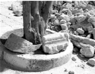
Carved stone from Jewish Temple era