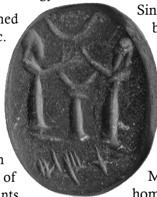
1 st Temple Seal

“The Old Testament books of Kings and Chronicles recount the tunnel’s origins: Hezekiah, king of Judea,