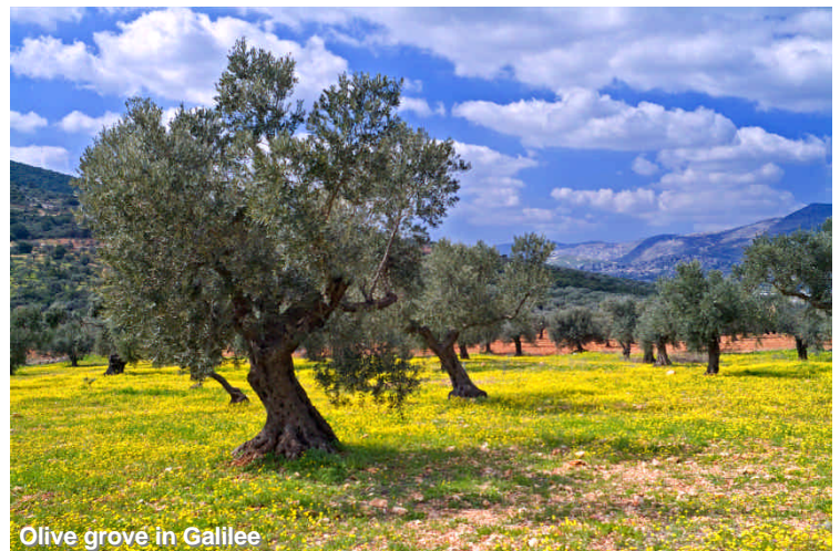
Olive grove in Galilee

Barren land transformed to the fertility of ancient Israel is a miracle predicted in Scripture (Amos 9:14-15; Ezek. 36:34-35). It was long assumed that most of Palestine was wasteland, irreclaimable for agriculture. But archaeologists discovered the presence of more than 70 ancient settlement sites in one 65-mile stretch of the Jordan Valley alone, each with its own well for water. Lot, over 3,000