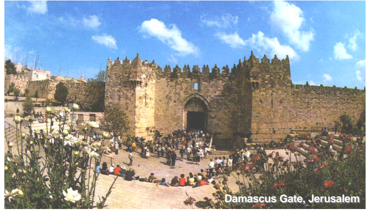
Damascus Gate, Jerusalem

Listen to the videotaped words of a young 21-year-old mother of two on her way to a suicide bombing in Gaza (Jan. 1, 2004): “I always wanted to be the first woman who sacrifices her life for Allah. My joy will be complete when my body parts fly in all directions.” Why was she so mentally sick? Not because she had been humiliated and oppressed as a Palestinian, but because she had been a manipulated